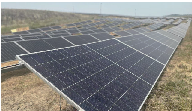
Figure 1: Project Picture